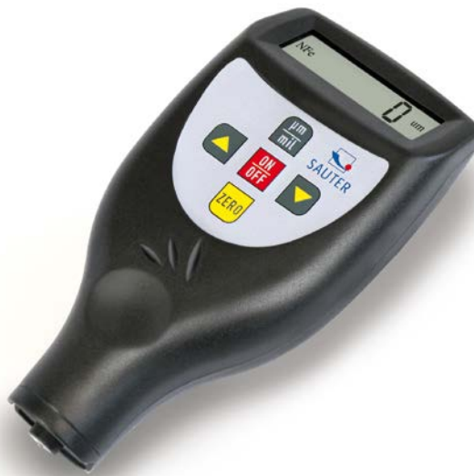
Illustration: TC 1250-0.1FN